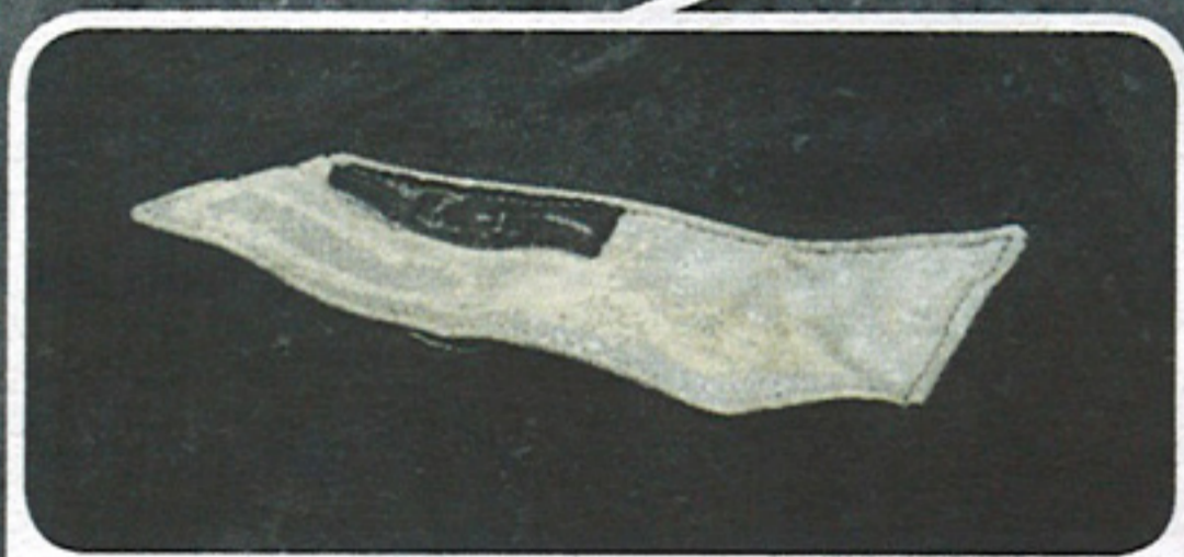
Pocket flap is sun damaged and worn out, reflective material almost gone. Yet, pocket worked, nothing ever fell out.

For more information, go to aerostich.com