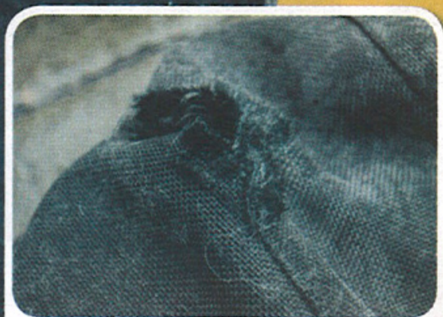
30 mph lowside, not a mark on my skin or knee!