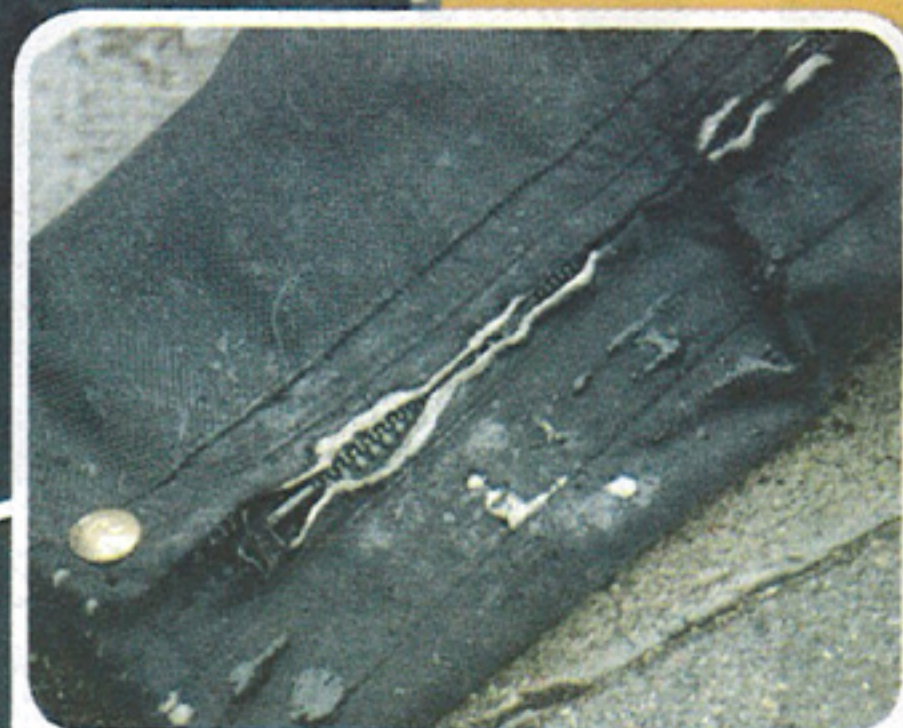
Worn from use, never affected the excellent zipper