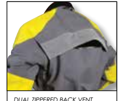
DUAL ZIPPERED BACK VENT