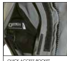
QUICK ACCESS POCKET