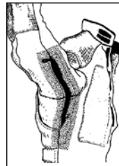
1. UNDERARM ZIP STITCHING

The stitching adjacent to the underarm zips (1) and leg zips (2) can only be hand sealed using Aqua Seal®, Seam Grip®, or other commercially