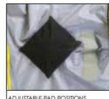
ADJUSTABLE PAD POSITIONS