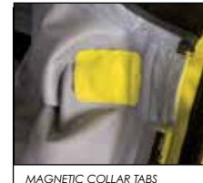
MAGNETIC COLLAR TABS