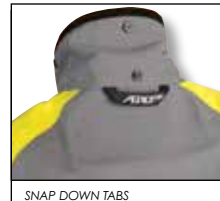
SNAP DOWN TABS

The elbow and knee pads may be located up or down by as much as 2" to position the pads for optimum protection, comfort and fit.