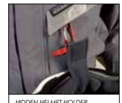
HIDDEN HELMET HOLDER