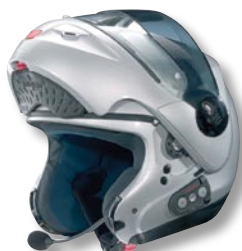
BASIC KIT & INTERCOM E-BOX INSTALLED ON AN N-102 HELMET

To take full advantage of the Basic Kits, you'll need an "e-box". The e-box is a small, thin, black box that installs on the side of the helmet when you remove the small door that is located on the left side of all N-Com ready helmets. Each e-box comes with a charger and a battery.