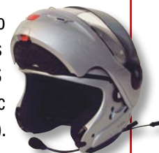
BASIC KIT INSTALLED ON AN N-102 HELMET

Each helmet must be equipped with a Basic Kit. It includes earphones, a microphone and two short wires (hanging from the underside of the helmet) that allow you to plug in various devices and the charger (for an e-box). The Basic Kit will permit you to listen to an music player or a GPS unit, etc., and talk on your cell phone. Basic Kits are specific for each helmet, so there is a Basic Kit for the N-102 (#1266), N-103 (#1291, not pictured) and a different one for the N-42 (#1267). The Kit can be installed in minutes inside the helmets, without any tools or modifications.