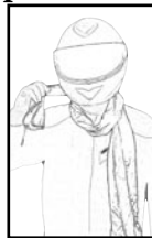
Fig. 2. Bring the long end over the short end and around neck. Repeat for more neck coverage.