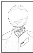
Fig. 3. Pull to desired tightness and tuck loose ends into jacket. Go ride your motorcycle.

QUESTIONS: PLEASE CALL US AT 218 722 1927