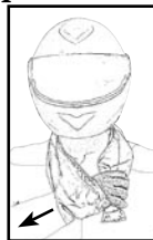
Fig. 2. Pull the loose ends through the loop made by the fold of the scarf.