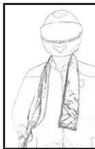
Fig. 1. Fold in half width wise and drape over shoulders with one end hanging a third longer than the other.

Silk was the fabric of choice for the scarves open cockpit airplane pilots wore in the early days of aviation. It is a natural protein and is both highly absorbent and easily discharges humidity. So it can keep your skin moist while letting it also breathe. It's unique slipperiness against sensitive neck-skin was important to early riders and pilots alike.