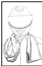
Fig. 1. Fold in half lengthwise, creating a loop on one end. Drape evenly over shoulders.