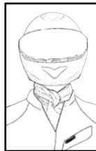
Fig. 3. Pull to desired tightness and position knot in center of neck. Tuck loose ends into jacket and ride.