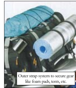
Outer strap system to secure gear like foam pads, tents, etc.