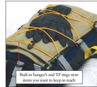
Built-in bungee's and 'D' rings stow items you want to keep in reach