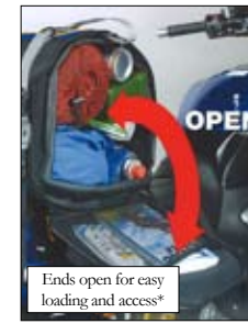
Ends open for easy loading and access*