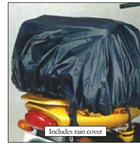
Includes rain cover