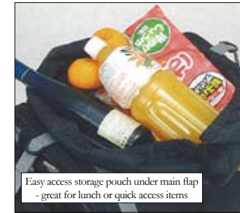
Easy access storage pouch under main flap - great for lunch or quick access items