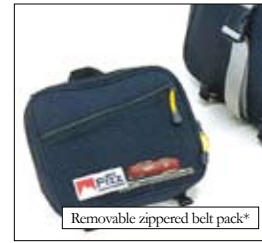
Removable zippered belt pack*

* noted features available on Mid and Lg Bags only